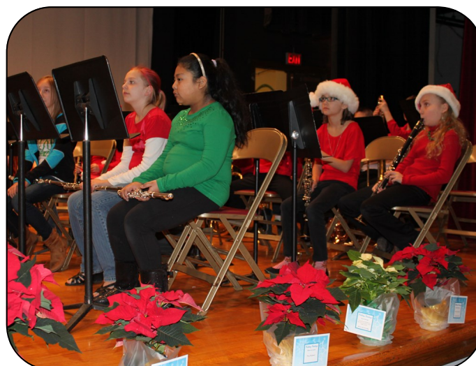
Elementary Band members warm up for the Pratt Elementary Holiday Concert.