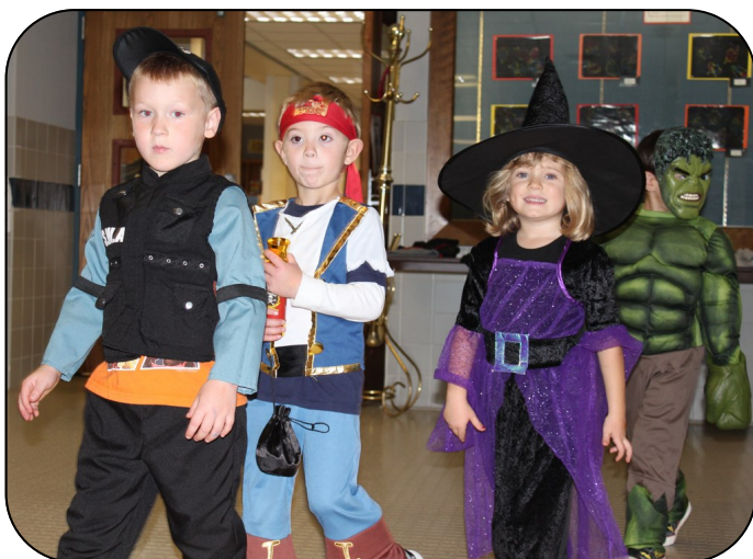
Pratt Elementary students parade in costumes on Halloween.

An example of this fun was our recent Halloween festivities. Grades PreK-4 had a fantastic day of activities culminating with our annual Halloween Parade. The H.S. cheerleaders and our music department added some excitement to an already busy day.