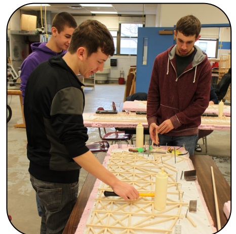
Seismic Tower and Bridge Design for Tech Wars 2014.