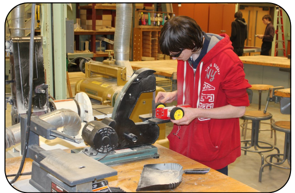
Tech Wars King of Hill robot construction.

Barker Technology students have been competing at NCCC Tech Wars since 1996 and have won numerous competitions.