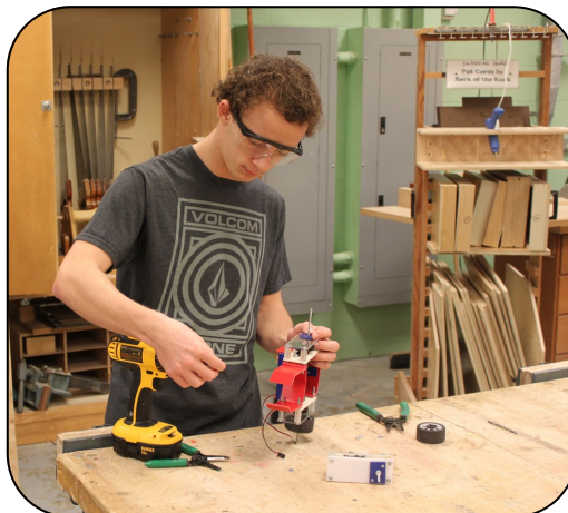
Radio-controlled robot construction for Tech Wars.