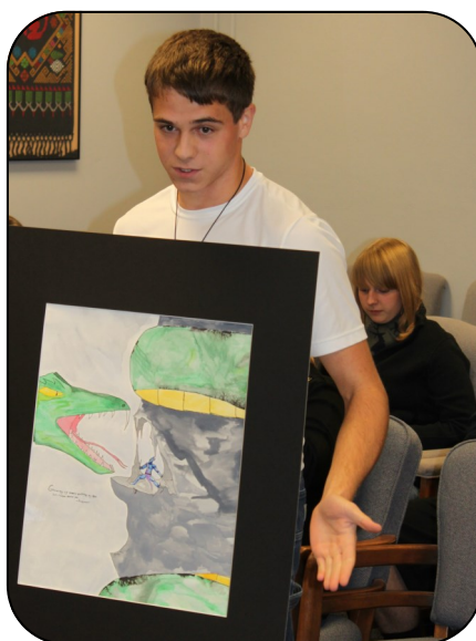
Presentations from high school art students were made to the Board of Education.