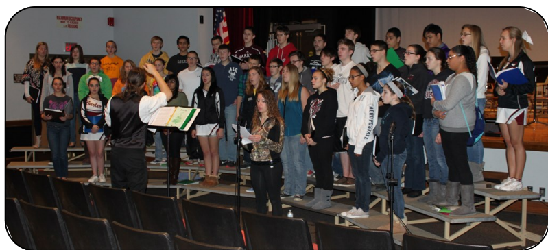
Holiday Pops rehearsal for the High School Concert Choir.

Rehearsals for the musical "Pajama Games" are already underway with performances scheduled March 14 through March 16.