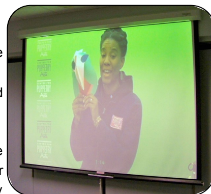
An instructor explains masks to 3rd graders.

These curricular excursions include aligned supplemental resources to encourage deeper investigation and hands-on activities to bridge learning with psychomotor skills. Our students will continue to experience new worlds with endless opportunity as we transport them to places around the globe with this exciting technology.