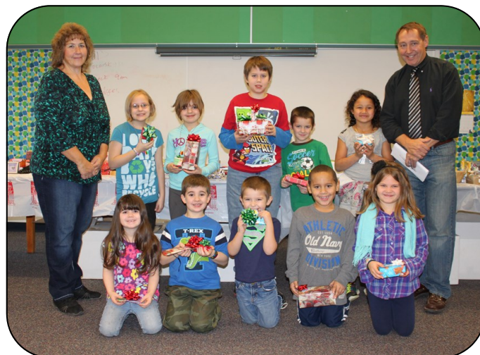
Students enjoyed their time at the PTSA Holiday Gift Shop.

December offered a chance for students to experience the joy of giving again with our PTSA sponsored holiday gift shop. Several of our PTSA members worked in the shop all week helping children buy gifts for their families.