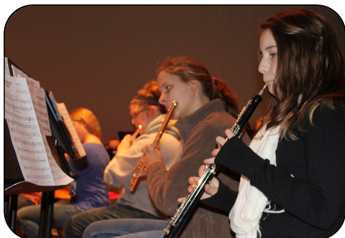
High School Concert Band prepares for holiday concert.

The 2014 Latrator is now on sale! Orders can be placed online at www.jostens.com or forms can be picked up in the high school office. Order before December 31 to get the discounted price!